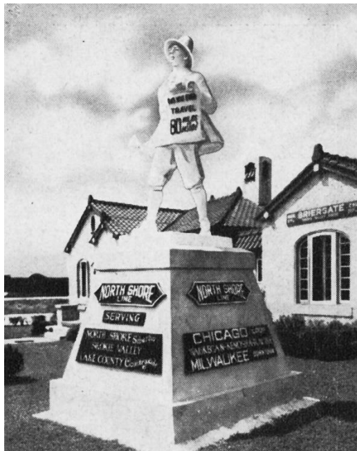
Town Crier, Briergate Station, Highland Park, Illinois, 1928 – an 18th Century tradition promoting 20th Century speed. The Highball magazine, August-September 1928.

As automobile ownership rose, the interurban railway industry had begun its inexorable decline. The year 1915 was the last year of interurban construction of any significance; the year before was the beginning of a long series of abandonments. 2 The industry responded by venturing into freight service to increase revenue, lightweight passenger cars operated by a single crewman to cut passenger crew costs, and finally speed as a means of self-promotion. On their station grounds, the Insull Group's North Shore Line promoted its speed with statues of town criers asking the question "Did you ever travel 80 miles an hour?"